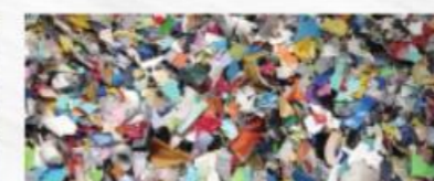
PE crushing tablets / PE粉碎片