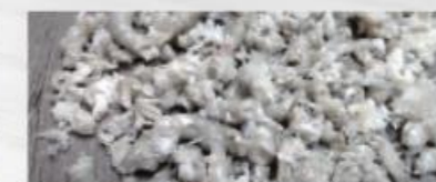
PE washing and squeezing dry film / PE膜水洗擠乾料