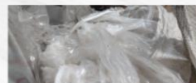
PE film / PE膜